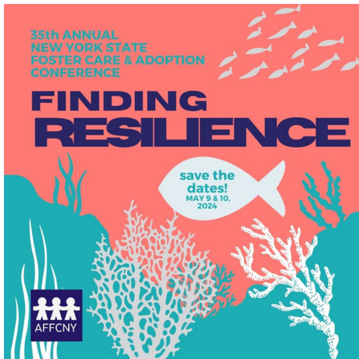
Exhibit Table Fees are $400 each.

Includes one draped 8' table and 2 chairs in the main reception area of the IN PERSON conference. Digital materials provided by exhibits will also be available for any virtual attendees in the online conference community. The Exhibit Table Fee also includes all meals as included in standard registration.